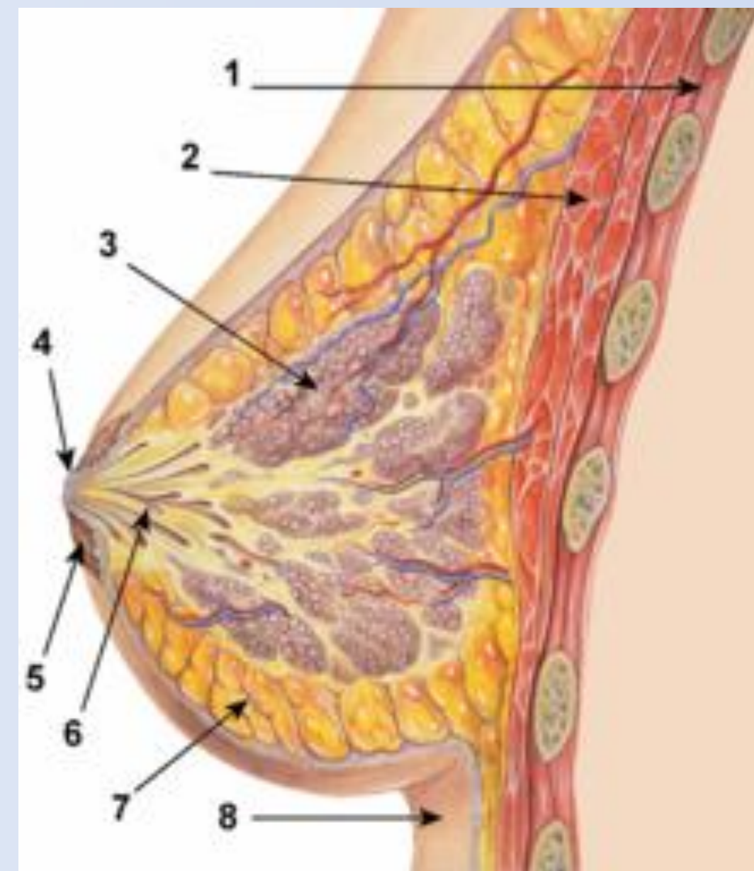
Breast implant: Cross-section scheme of the mammary gland : 1. Chest wall 2. Pectoralis muscles 3. Lobules 4. Nipple 5. Areola 6. Milk duct 7. Fatty tissue 8. Skin envelope

A breast implant is a medical prosthesis used to augment, reconstruct, or create the physical form of breasts .